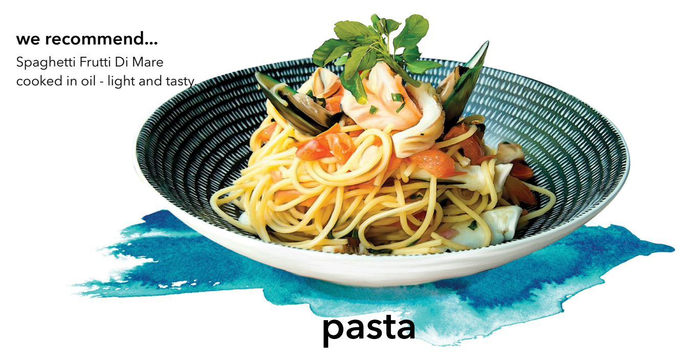
GLUTEN FREE OPTION AVAILABLE - ADD $4.50